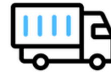
Logistics and Transportation