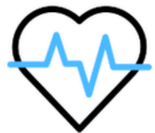
Health and Social care