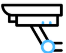
Security and Access control