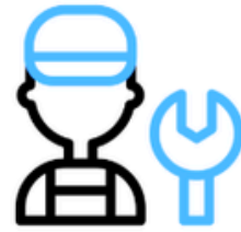
Maintenance and Facilities