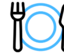
Catering and Food services