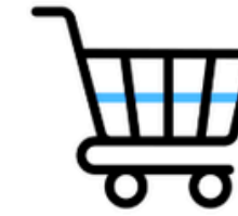
Retail and customer service