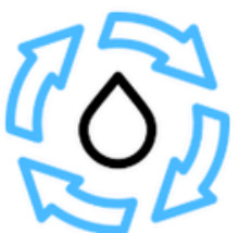
Water Management and treatment